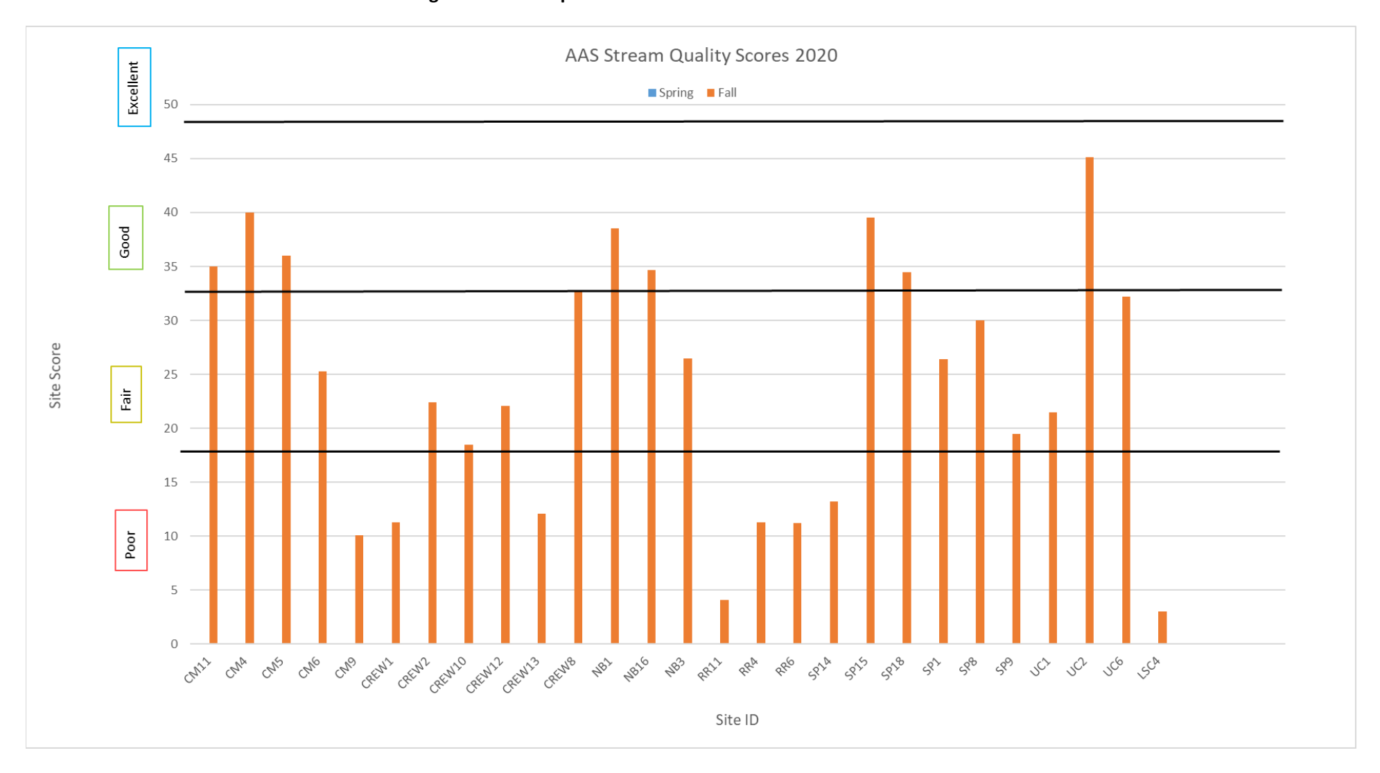
Figure 2: Bar Graphs of Macroinvertebrate Scores from Fall 2020.