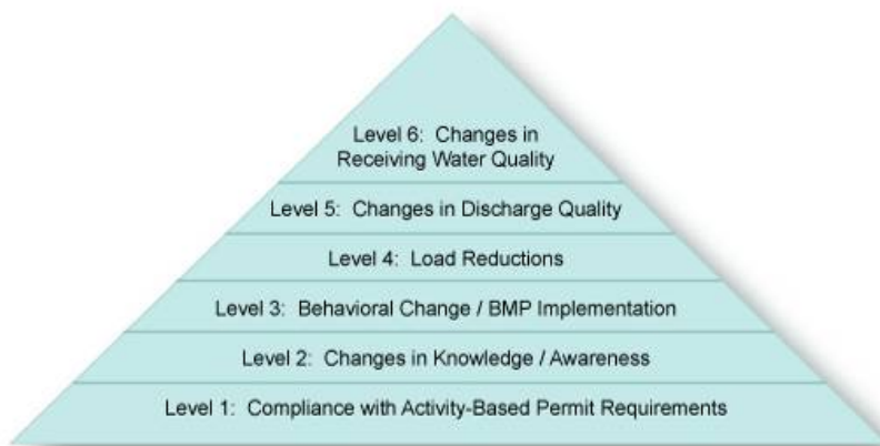
Figure 9-2. Success levels.

Measures of success, or 'evaluation mechanisms', are essential to gauge implementation status and assess the effectiveness of the overall program. Identification of quantifiable measures provides both measurability and accountability within the program. Six success levels have been established, as shown in Figure 9-2, to provide an organizing framework for the evaluation mechanisms.