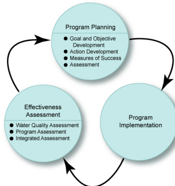
Figure 9-1. Relationship between the three elements.

The relationship between the three elements is presented in Figure 9-1. They are discussed in the following subsections.