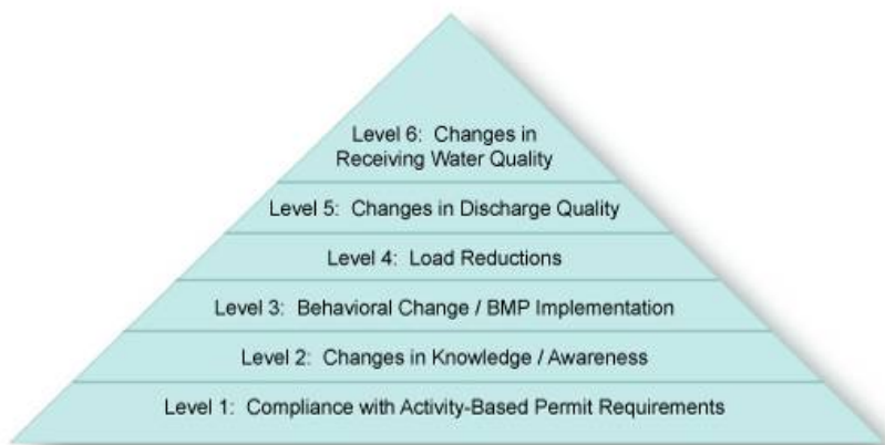
Figure 9-2. Success levels.

Measures of success, or 'evaluation mechanisms', are essential to gauge implementation status and assess the effectiveness of the overall program. Identification of quantifiable measures provides both measurability and accountability within the program. Six success levels have been established, as shown in Figure 9-2, to provide an organizing framework for the evaluation mechanisms.