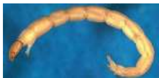
Midge Larvae (Chironomidae)