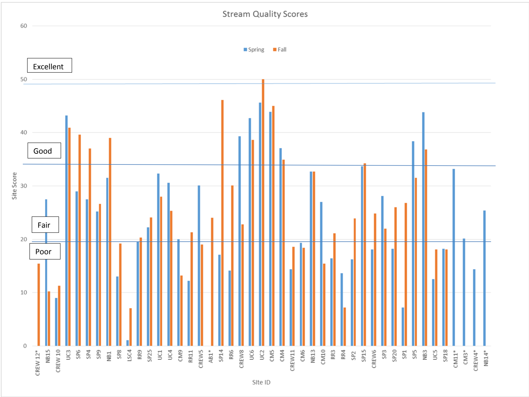
Figure 1. Bar graph of Stream Quality scores (based on Adopt-A-Stream volunteer macroinvertebrate samples) for spring and fall 2017.